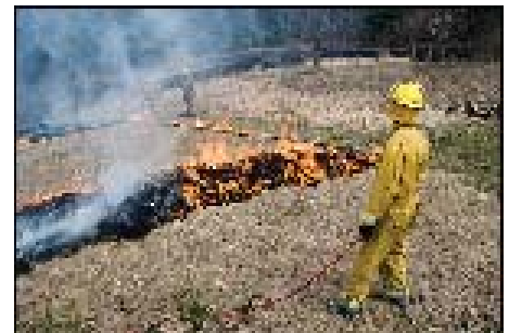
Prescribed burn is used to encourage growth of native vegetation.