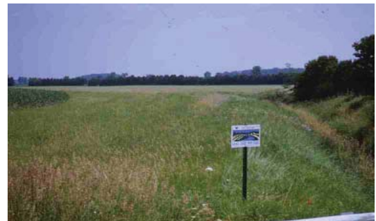
(top and bottom) Buffer strips between crops and drainage ditches help stabilize ditch slopes.

from runoff, a buffer should be at least 100 feet wide, according to some scientific literature, with an additional 2 feet of width for every 1 percent of slope. Deep-rooted grasses or native plants are the most effective buffer vegetation for minimizing the impacts of sheet flow runoff from surrounding agricultural fields. Where wind is a factor, trees and shrubs growing in the buffer increase the buffer's ability to prevent wind from eroding valuable topsoil.