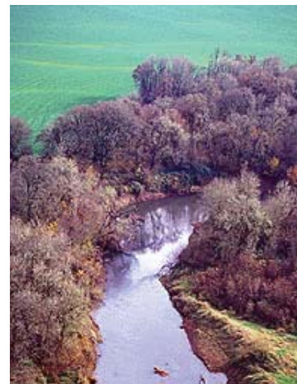
Buffers of trees, shrubs, and grasses protect this stream.