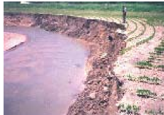
A vegetation buffer strip along with bank protection could have reduced erosion and the loss of valuable cropland.

nutrients cause excessive growth of algae and aquatic plants, deplete the oxygen level of water, and degrade water quality. Soil microbes and grass in buffer strips, however, can facilitate the transformation and uptake of these pollutants, thus protecting surface water resources.